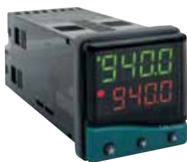
Model 9400 48 x 48 mm (1/16 TH DIN)

Integrated auto-tune makes P.I.D. control simple and efficient, while the unique dAC function minimises overshoot problems associated with conventional P.I.D. Controllers.