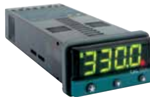
Model 3300 48 x 24 mm (1/32 ND DIN)