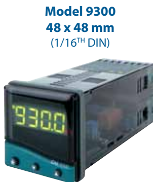
Model 9300 48 x 48 mm (1/16 TH DIN)