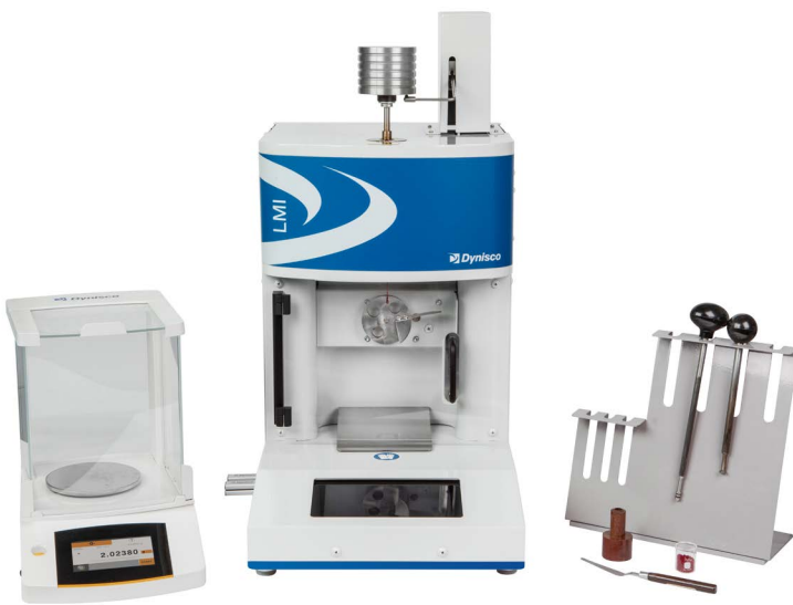
SHOWN WITH ALL AVAILABLE OPTIONS

THE MOST ACCURATE MELT FLOW INDEXER WORLDWIDE